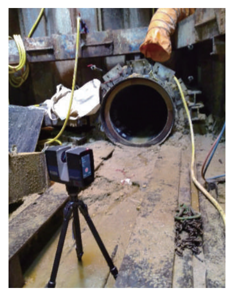
三維激光掃描儀在工地的使用情況 Use of laser scanner on site

"Time is king" – in the construction industry, no one doubts that we are all working against the clock. The emergence of 3D laser scanners is indeed a welcome news for our industry.