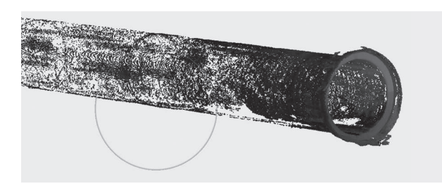
掃描物體 – 地下九米深的喉管 Scanned object – pipe buried 9-meter below ground